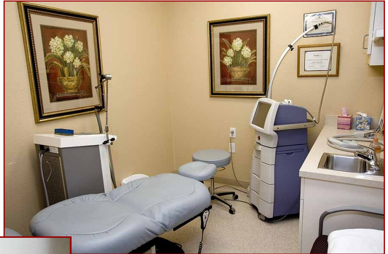
Spa Treatment Room